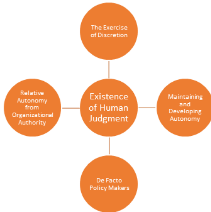
Figure 1. Street-Level Bureaucracy Framework for Education Policy Discernment Tenets (Witenstein and Abdallah, 2022).

To further explain, the core element, existence of human judgment, highlights the nature of street-level bureaucrats work. As street-level bureaucrats encounter unique and ambiguous cases while serving others at the front line, these conditions call for them to resort to their human judgment rather than the direct application of policy (Lipsky, 2010). Subsequently, the four tenets are based on the presence of street-level bureaucrats' human judgment as they carry on their daily work. In order to make an independent judgment, street-level bureaucrats exercise discretion while maintaining relative autonomy and independence from their organisational authority. In addition, they strive to maintain and develop their autonomy in their role at their organisation. Finally, building on the last three tenets, the fourth tenet suggests that they become de facto policy makers when they maintain all tenets as they perform their job. Since all four tenets are interrelated, some street-level bureaucrats may not meet the components of one tenet if they do not perform in line with another tenet.