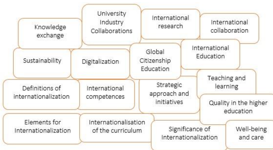
Figure 1. A thematic exploratory content analysis approach

We addressed our research questions through qualitative analysis, using qualitative data. A systematic review of literature was done through electronic search. The review was done with most articles from online databases, namely Taylor & Francis, Sage, Emerald, and Elsevier. The search approach concentrates on the keywords chosen such “internationalization”, “quality assurance”, and “transnational education”. The search locations were titles, abstracts, and keywords. After reviewing the 438 articles published between 2012 and 2024 in the systematic literature mapping, a deeper analysis was conducted for each of the 92 articles included in this review study. The inclusion criteria comprised peer-reviewed publications written in the English language. The collected and classified information and knowledge was then interpreted. This theoretical review used a grounded theory approach and a thematic exploratory content analysis approach as seen in Figure 1.