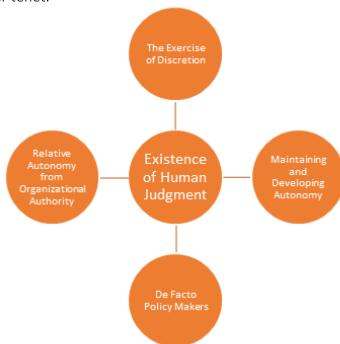
Figure 1. Street-Level Bureaucracy Framework for Education Policy Discernment Tenets (Witenstein and Abdallah, 2022).

To further explain, the core element, existence of human judgment, highlights the nature of street-level bureaucrats work. As street-level bureaucrats encounter unique and ambiguous cases while serving others at the front line, these conditions call for them to resort to their human judgment rather than the direct application of policy (Lipsky, 2010). Subsequently, the four tenets are based on the presence of street-level bureaucrats' human judgment as they carry on their daily work. In order to make an independent judgment, street-level bureaucrats exercise discretion while maintaining relative autonomy and independence from their organisational authority. In addition, they strive to maintain and develop their autonomy in their role at their organisation. Finally, building on the last three tenets, the fourth tenet suggests that they become de facto policy makers when they maintain all tenets as they perform their job. Since all four tenets are interrelated, some street-level bureaucrats may not meet the components of one tenet if they do not perform in line with another tenet.